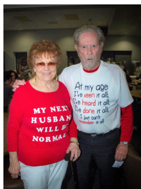
Thanks to everyone who participated in our Tee-Shirt Sunday in August.