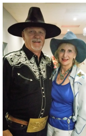
Just a few of the Oct. 29 "folk"

KEEP US POSTED IF YOU KNOW OF MEMBERS WHO ARE SERIOUSLY ILL