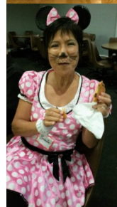
Winners of the costume contest are shown above.