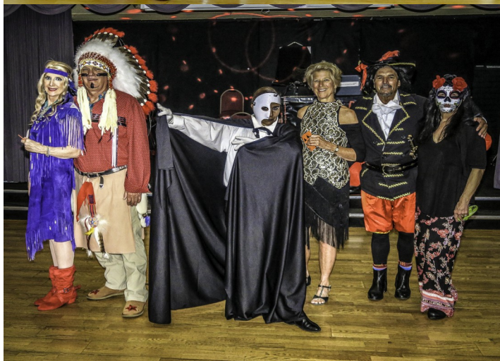
So many great costumes at the Halloween dance on October 28th