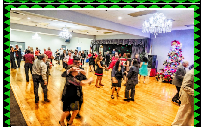
The Christmas Party was enjoyed by all