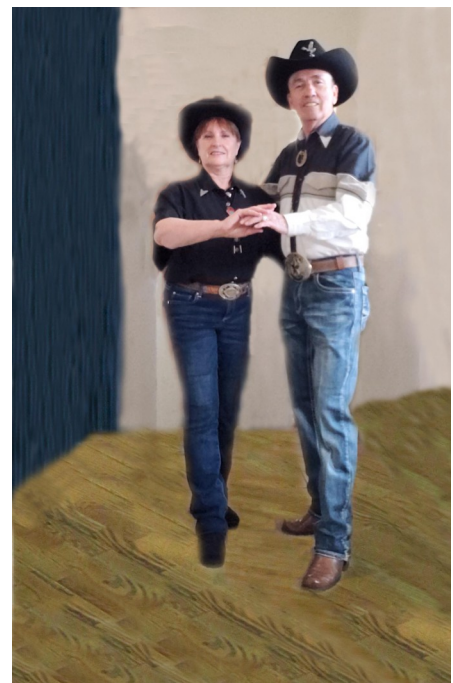
It was a fun shindig on Western Day, Jan 20th