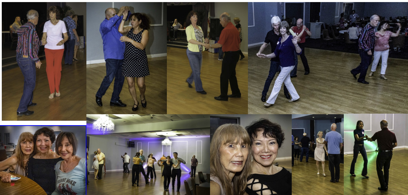
Having fun on and off the Dance Floor!