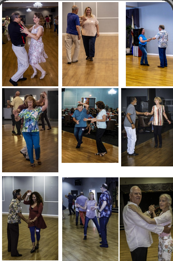
Having fun on the dance floor: If you would like to see more pictures like these go to our website www.sandiegoswingdance.com