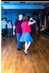
Fun around the Club