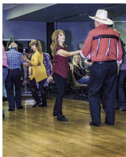
Victorian Tea at the Elks Lodge Nov 8th, 9th, & 10th, where the SDSDC showed videos of our club and distributed flyers of SDSDC

BRING JOY WITH A TOY Bring an unwrapped new toy and drop it in our collection box.