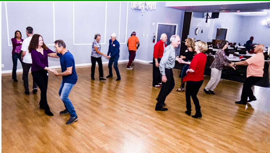
Everyone had fun at our Valentines Dance Feb 16th