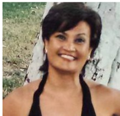
San Diego Swing Dance Club Board Members 2021—2022