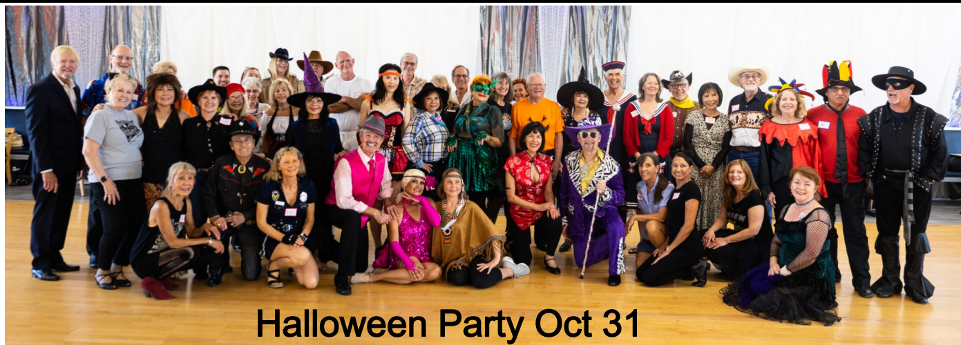
Halloween Party Oct 31