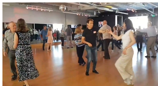
SDSDC members always have fun on the Dance Floor