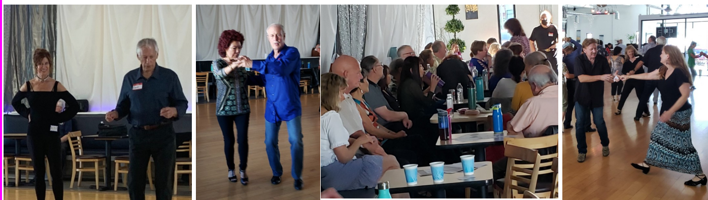
Having fun at San Diego Swing Dance Club