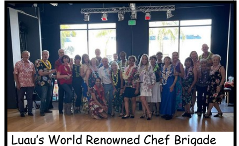
A celebration of food, dance, and our 50th State