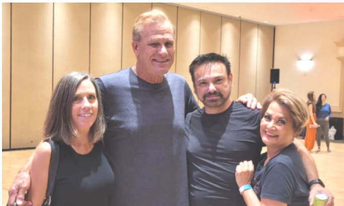
SDSDC Members attending ESS Dance Camp in Phoenix. Don't miss Paradise, Oct 19-22, in Irvine. Lots of SDSDC members will be there!