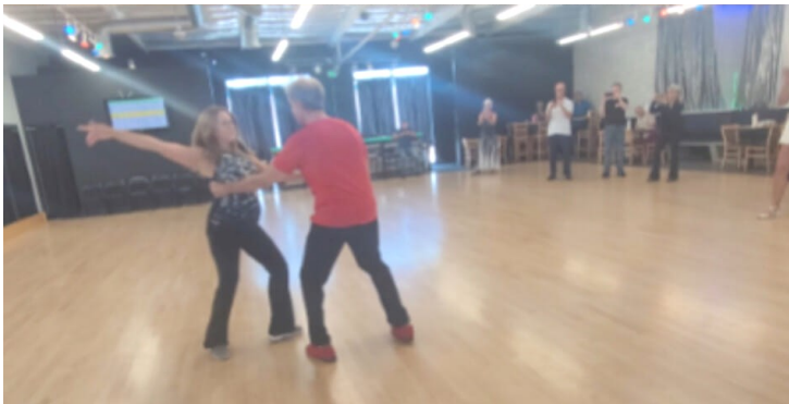
Photo collage from the July 21 SDSDC group lessons, courtesy of Maria Tee.