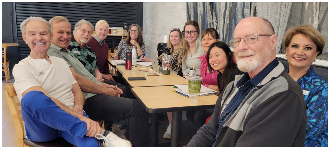
Photo from the January 12 Board Meeting.