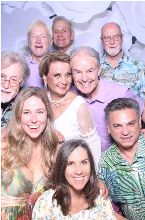
The entire board wouldn't fit in the photo booth!