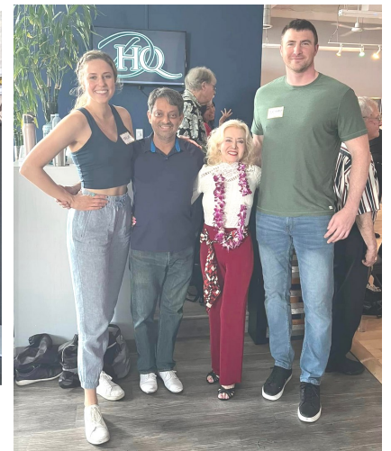
Dancers at our events seem to come in a variety of sizes!