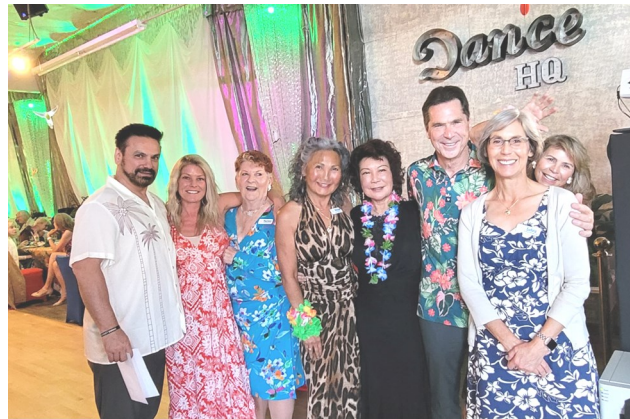
A group hug at our 54th Anniversary Party.