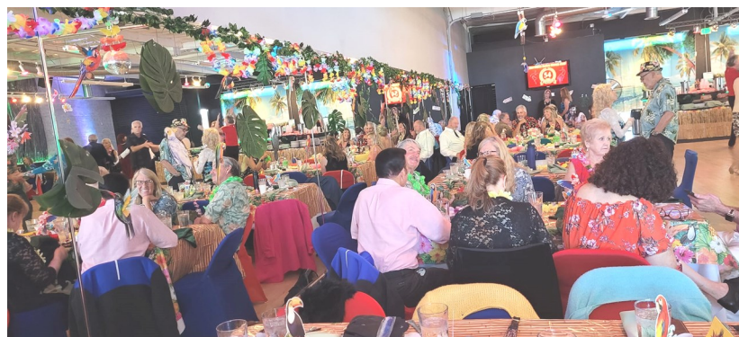
Such colorful decorations at the party!