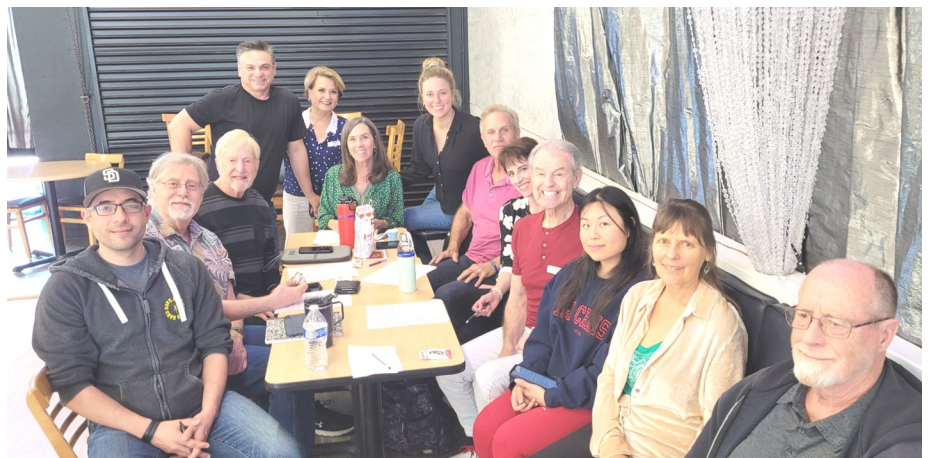
February Board meeting.