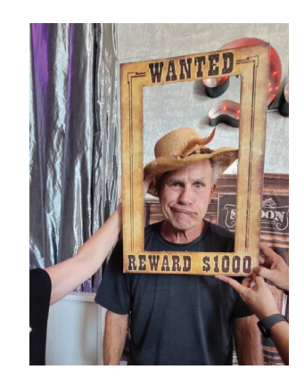
Photos from the June 15, 2025 Father's Day Celebration with a Wild West Theme!